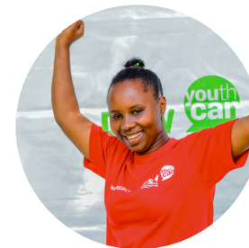
Mwanaima 25, Tanzania