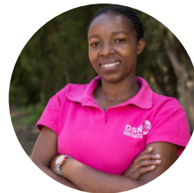
Burnice 25, Kenya